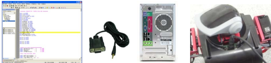
Robobasic program Down load cable PC port Down load port on PC

3. After finished installing robobasic, connect download cable to serial port at users PC. occasionally, notebook or netbook PC users need download cable for usb port. (option)